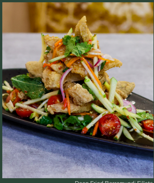
Deep Fried Barramundi Fillets