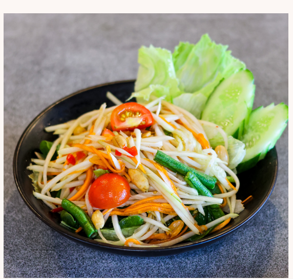
Som Tum (Papaya Salad)