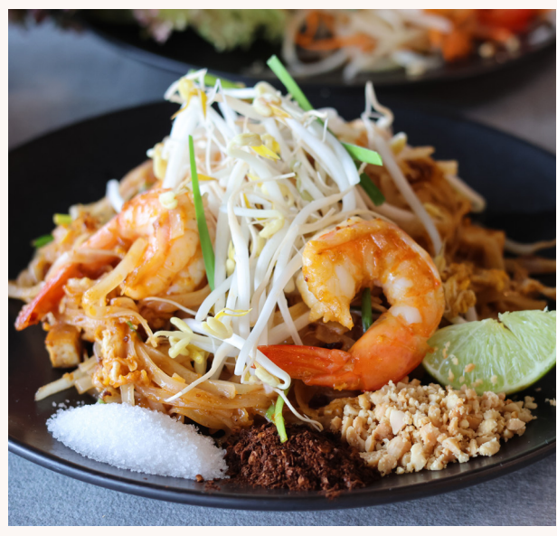
Pad Thai w/ Prawns

704 Peanut Satay Hokkien Noodles705 Laad Na (Gravy & Egg Noodles)