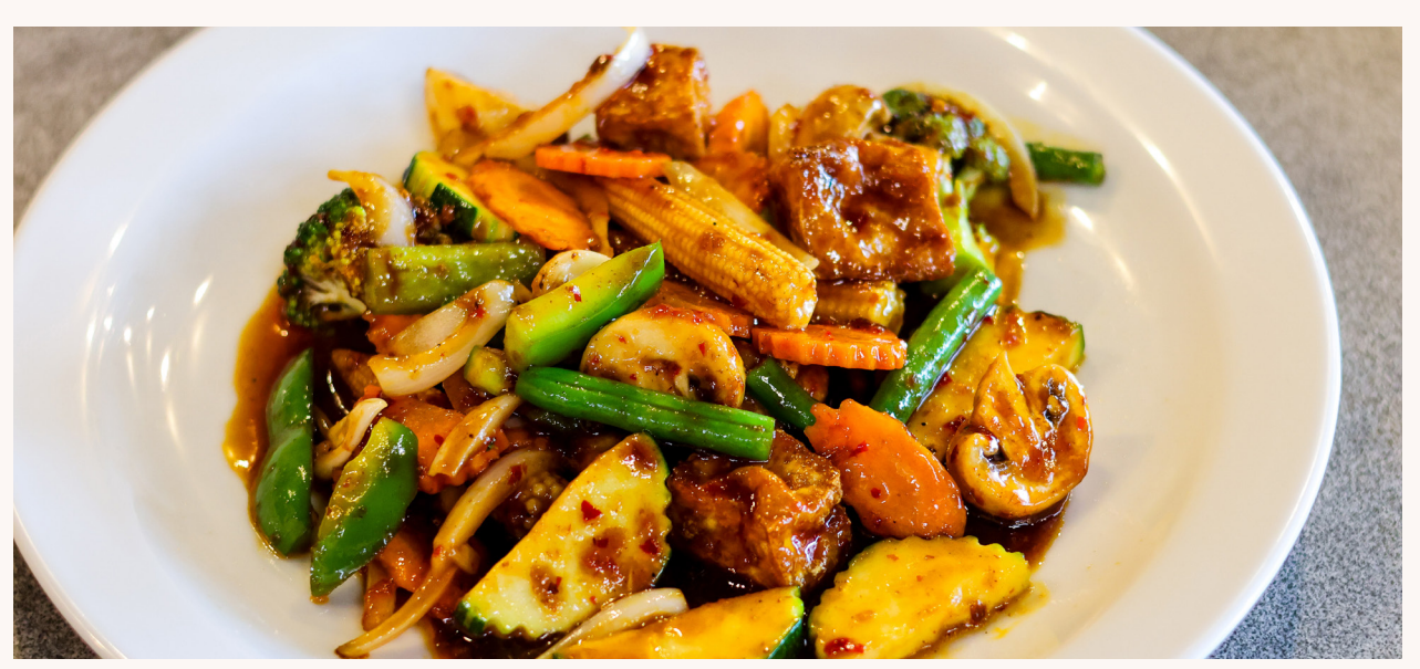
Chilli Jam Stir Fry w/ Tofu