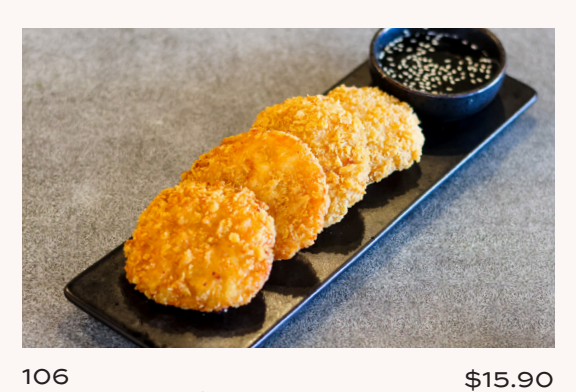
106 Prawn Cakes | 4pc