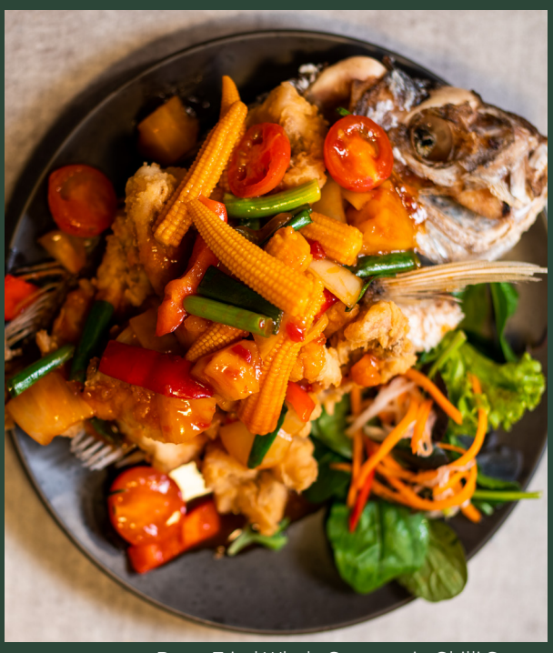
Deep Fried Whole Snapper in Chilli Sauce