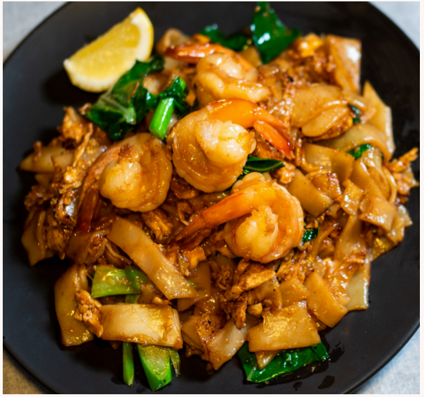
Pad See Ew w/ Prawns