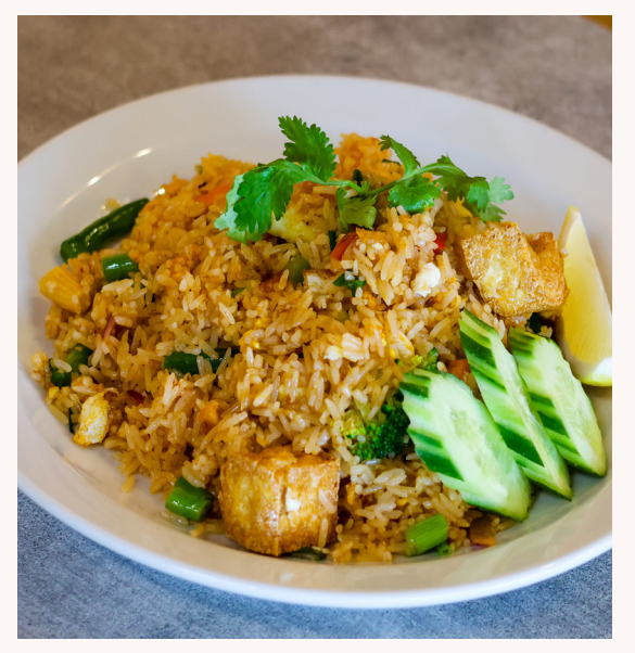
Tom Yum Fried Rice w/ Veg & Tofu