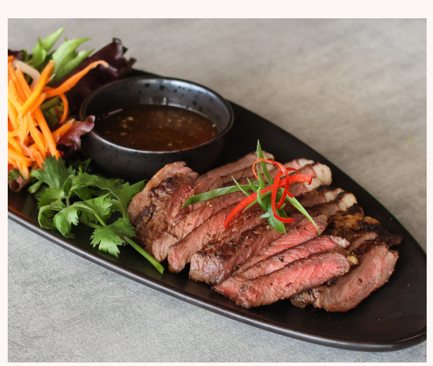
BBQ Beef (Crying Tiger)