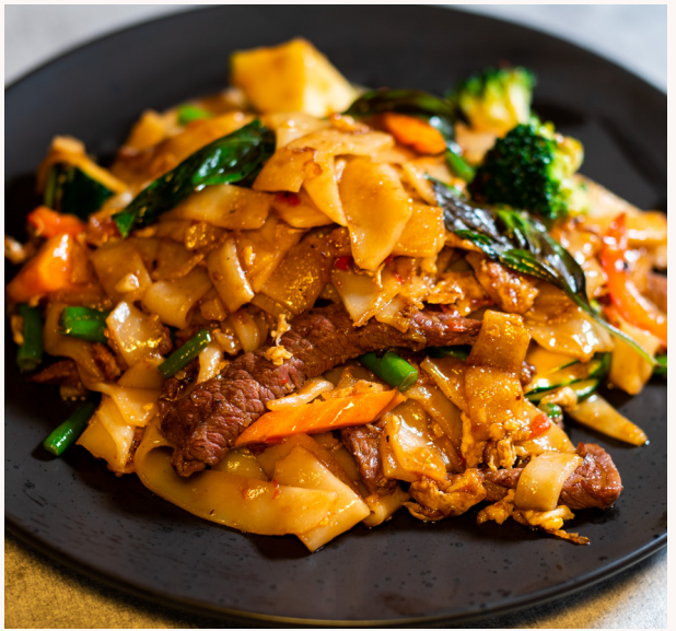
Pad Kee Mao w/ Lamb