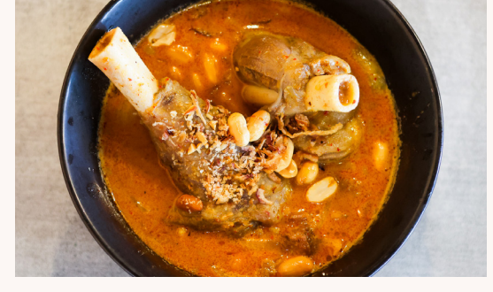
503 $32.90 Massaman Curry | Lamb Shanks