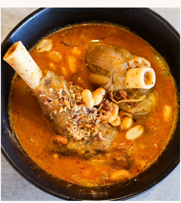
Massaman Curry | Lamb Shanks