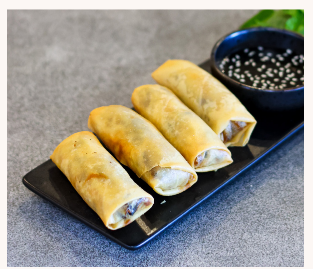
Prawn Spring Rolls