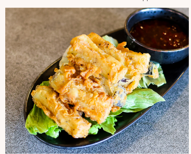
Salt & Pepper Eggplant