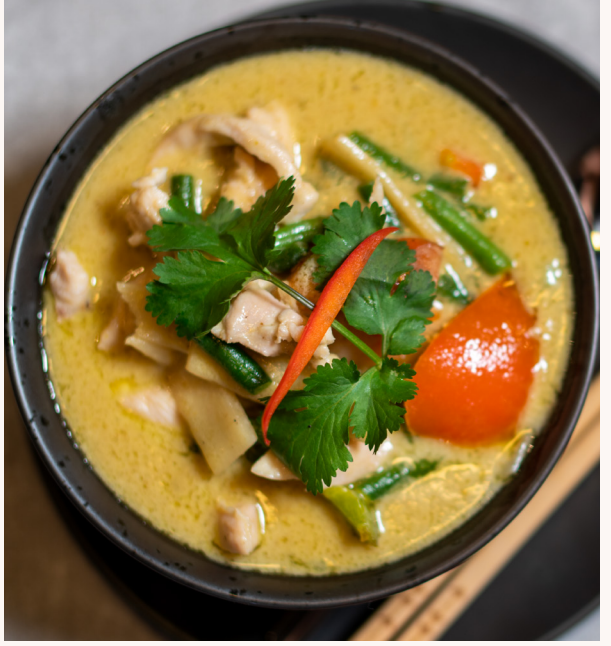
Green Curry w/ Chicken