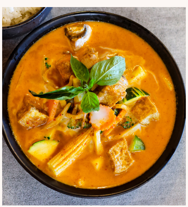
Red Curry w/ Veg & Tofu