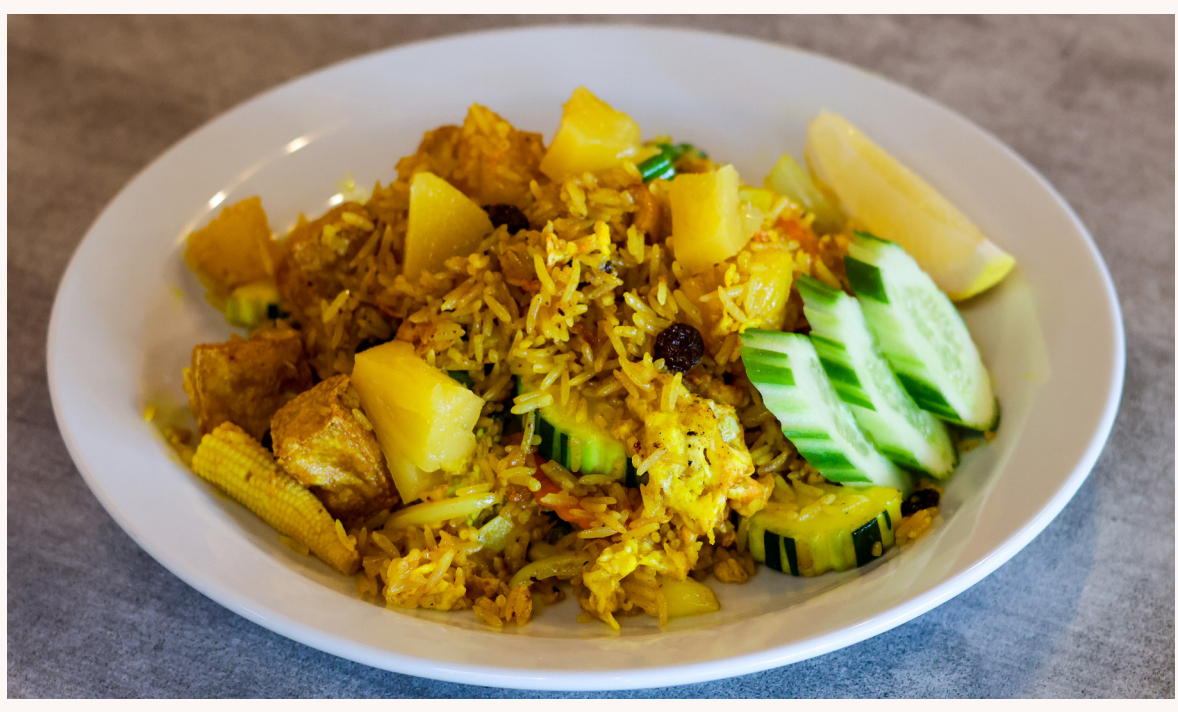
Pineapple Fried Rice w/ Veg & Tofu