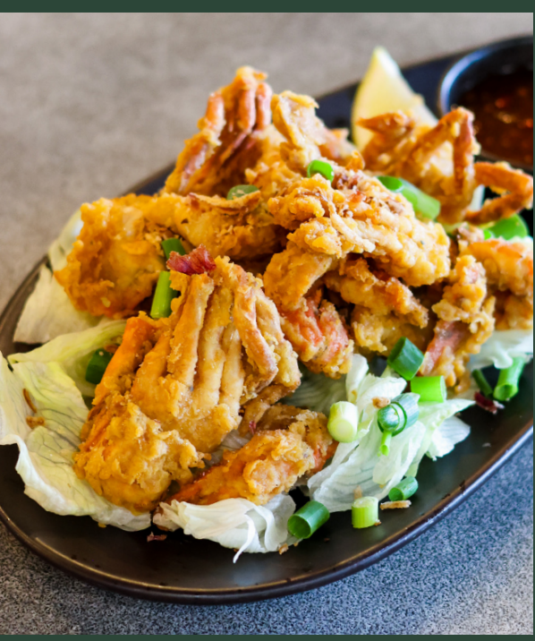
Salt & Pepper Soft Shell Crab