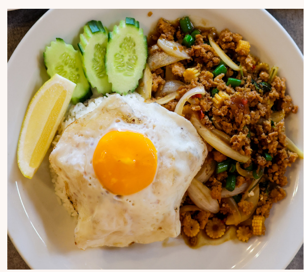
Pad Krapow Gai w/ extra Egg & Rice