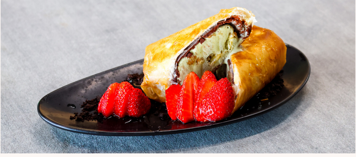
Deep Fried Pistachio & Baklava Gelato