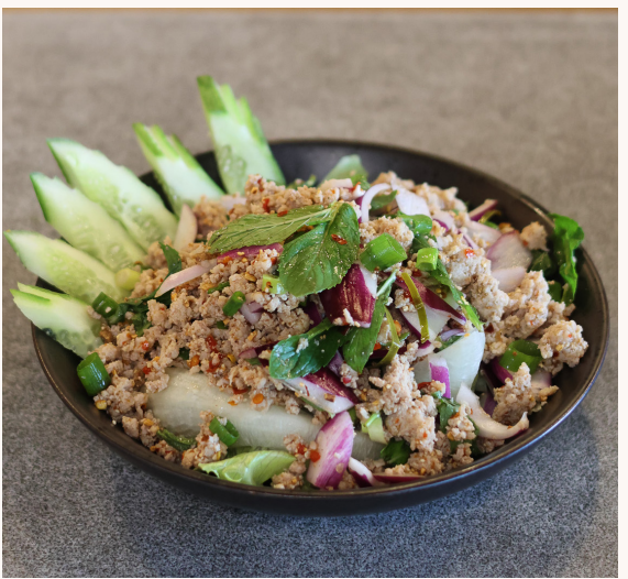
Larb Chicken Salad