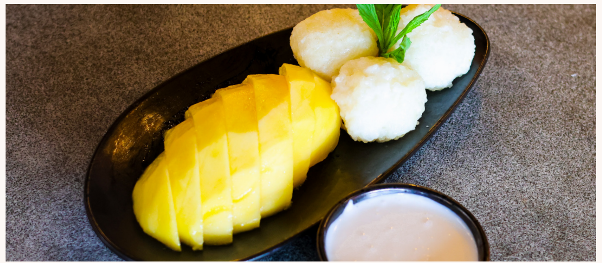
Mango Sticky Rice

1000 Mango Sticky Rice - subject to seasonal availability 1001 Deep Fried Pistachio and Baklava Gelato 1002 Black Bean and Coconut Sticky Rice $14.90