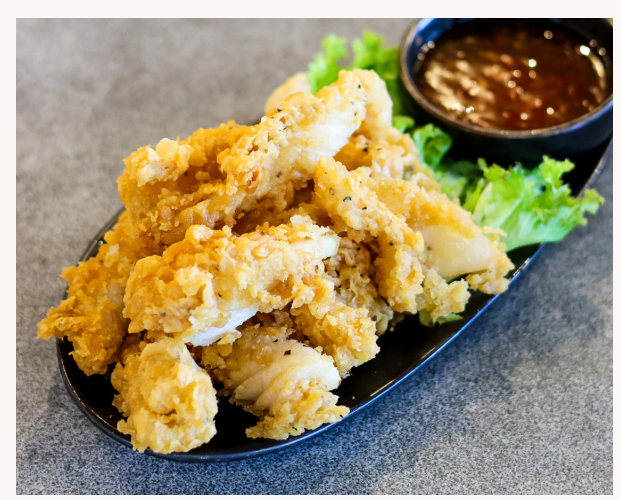
Salt & Pepper Calamari