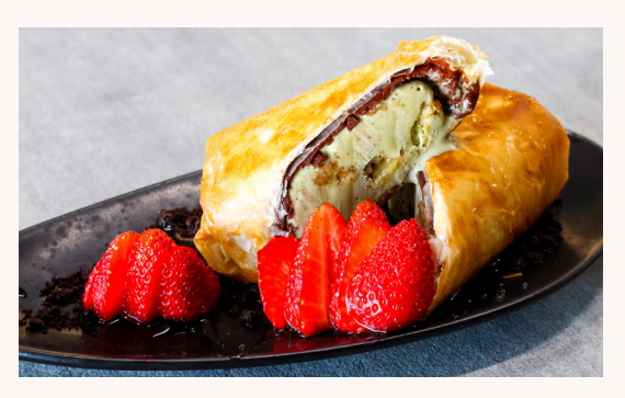
1001 $18.90 Fried Pistachio & Baklava Gelato