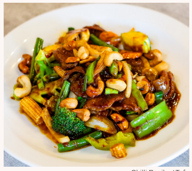
Chilli Basil w/ Tofu