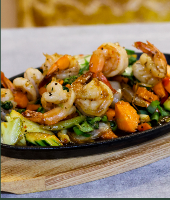
Sizzling Prawn Hot Plate