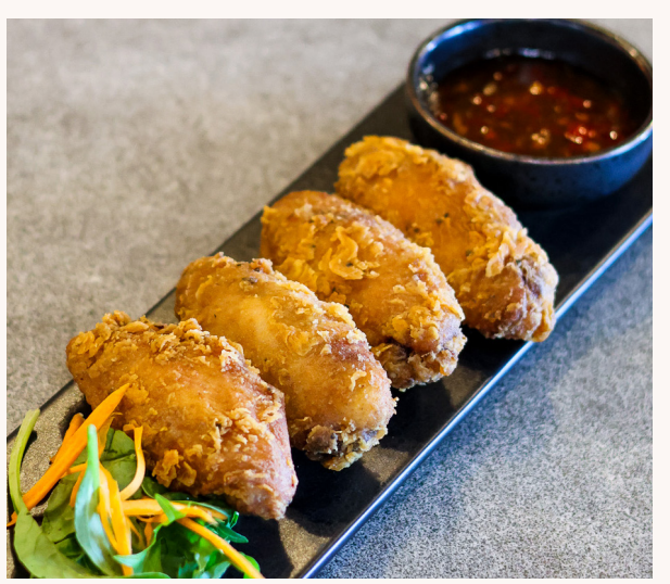
Fried Chicken Wings