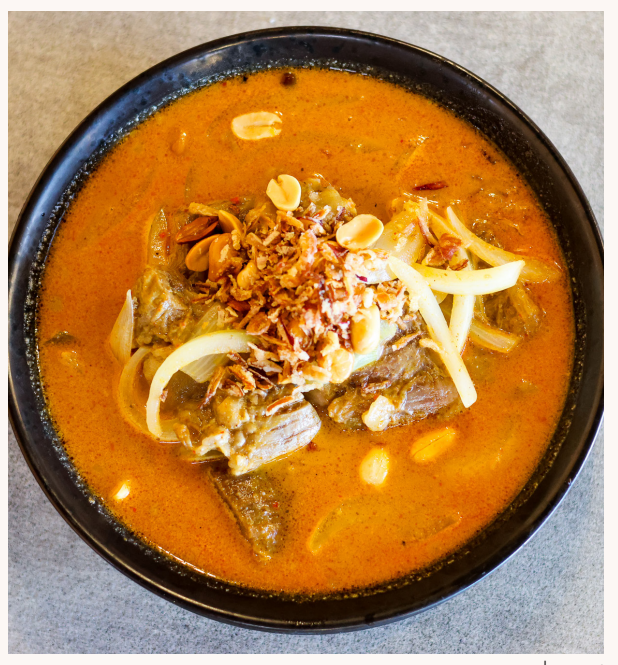
Massaman Curry | Beef