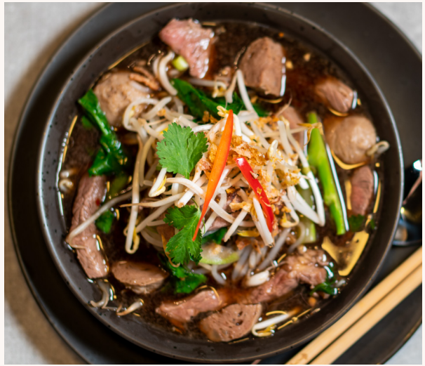
Beef Boat Noodle Soup