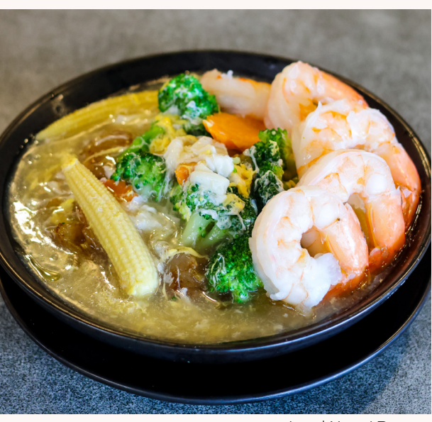
Laad Na w/ Prawns