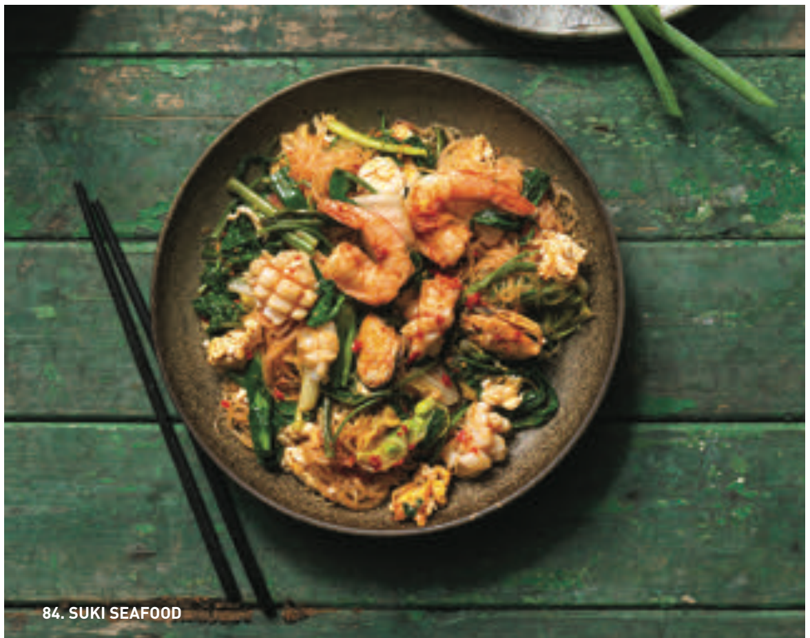
84. SUKI SEAFOOD