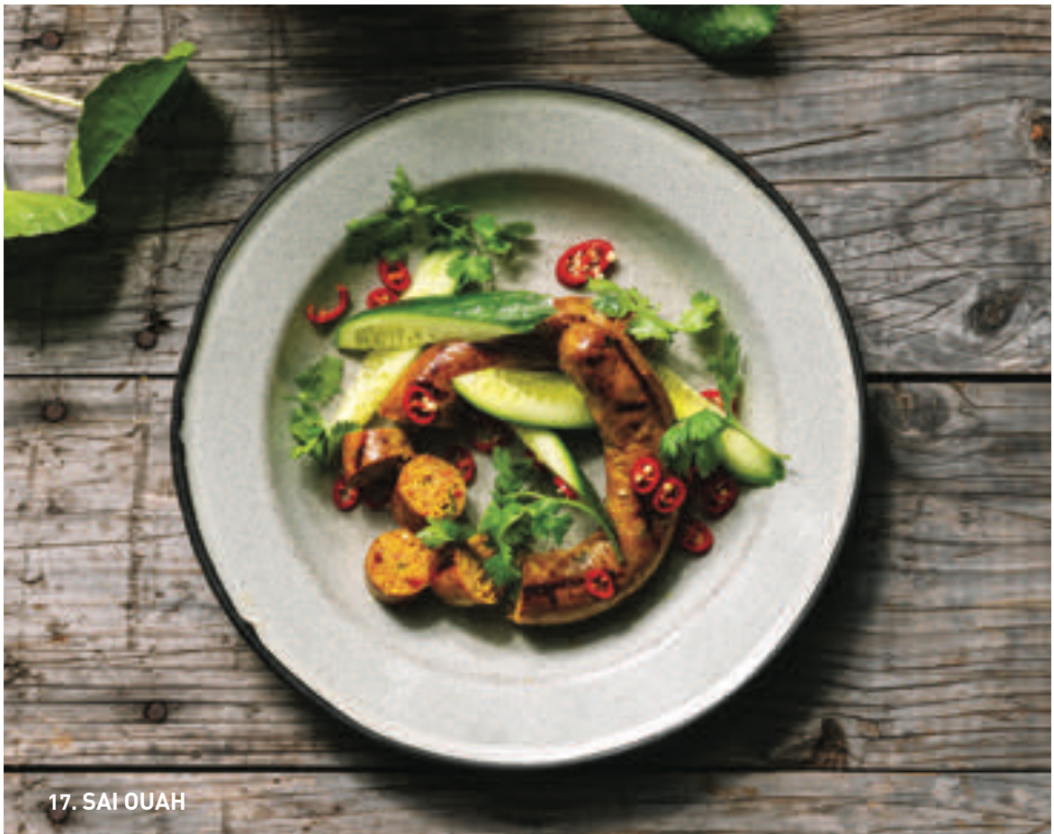
17. SAI OUAH