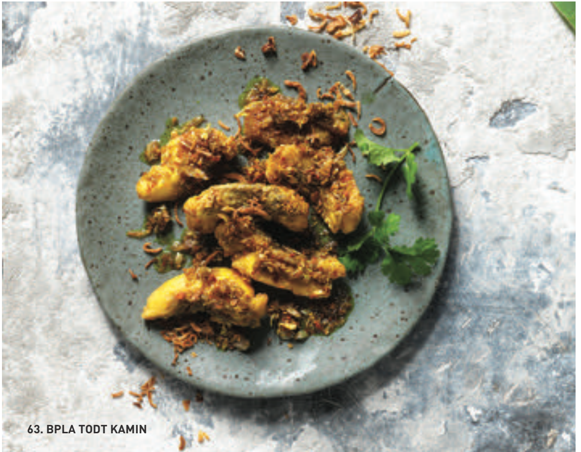
63. BPLA TODT KAMIN