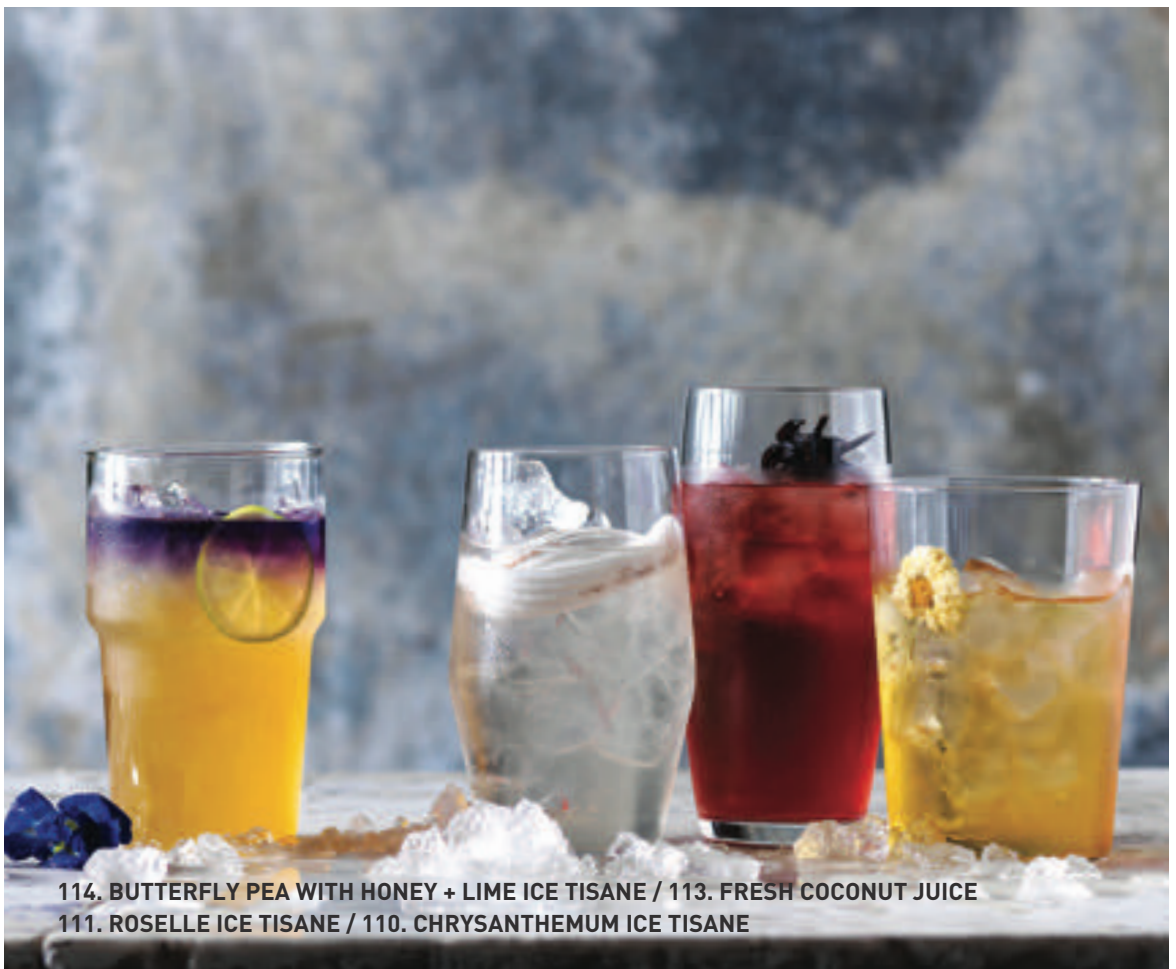
114. BUTTERFLY PEA WITH HONEY + LIME ICE TISANE / 113. FRESH COCONUT JUICE 111. ROSELLE ICE TISANE / 110. CHRYSANTHEMUM ICE TISANE