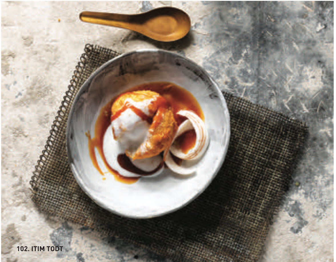
102. ITIM TODT