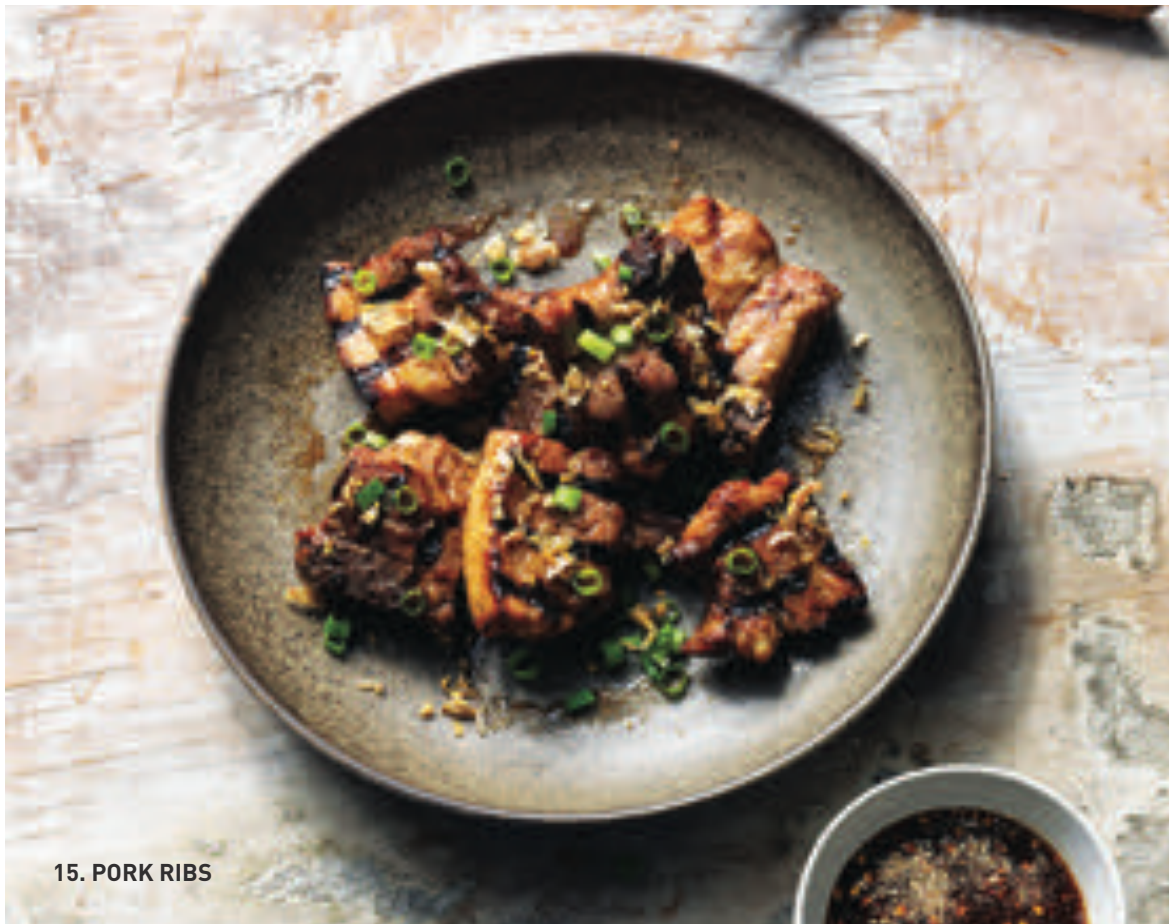
15. PORK RIBS