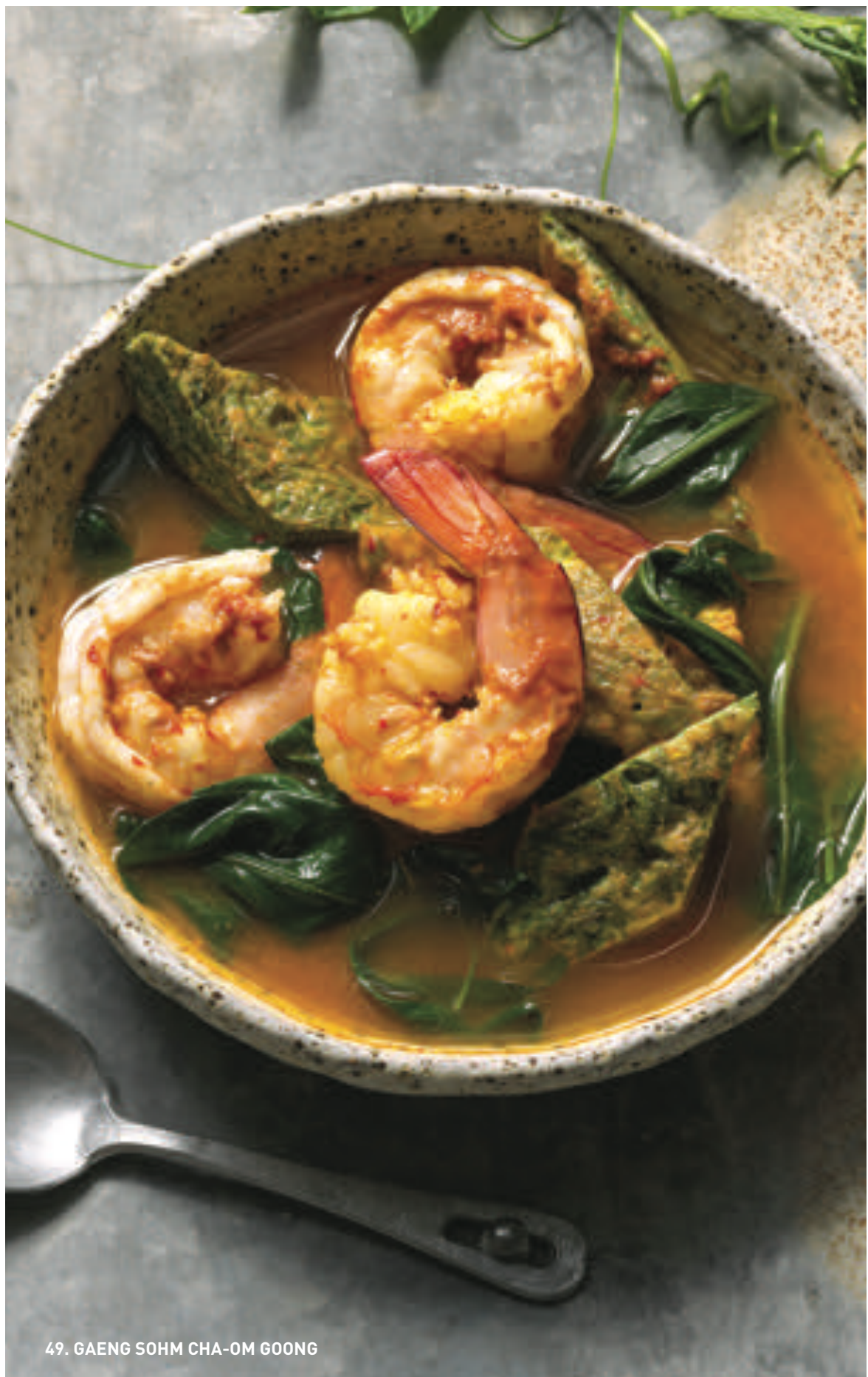
49. GAENG SOHM CHA-OM GOONG