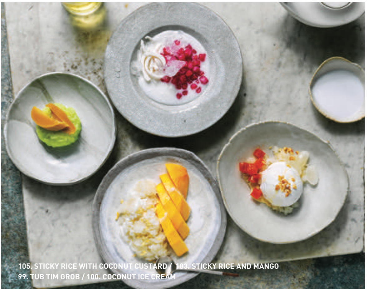
105. STICKY RICE WITH COCONUT CUSTARD / 103. STICKY RICE AND MANGO 99. TUB TIM GROB / 100. COCONUT ICE CREAM