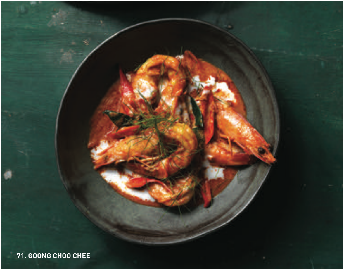
71. GOONG CHOO CHEE