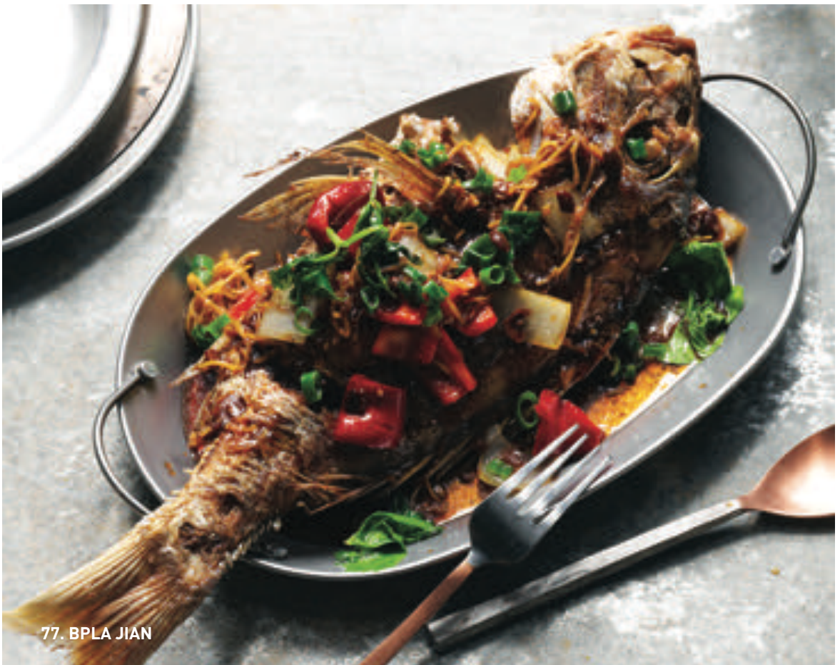
77. BPLA JIAN