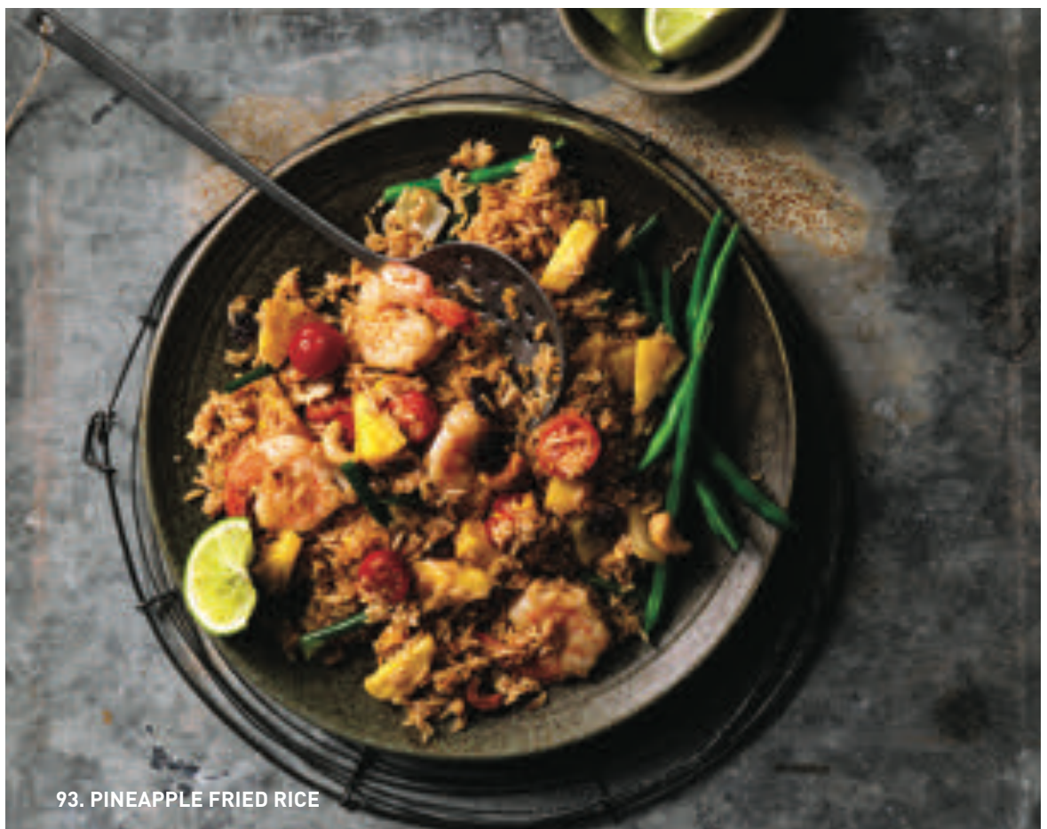
93. PINEAPPLE FRIED RICE