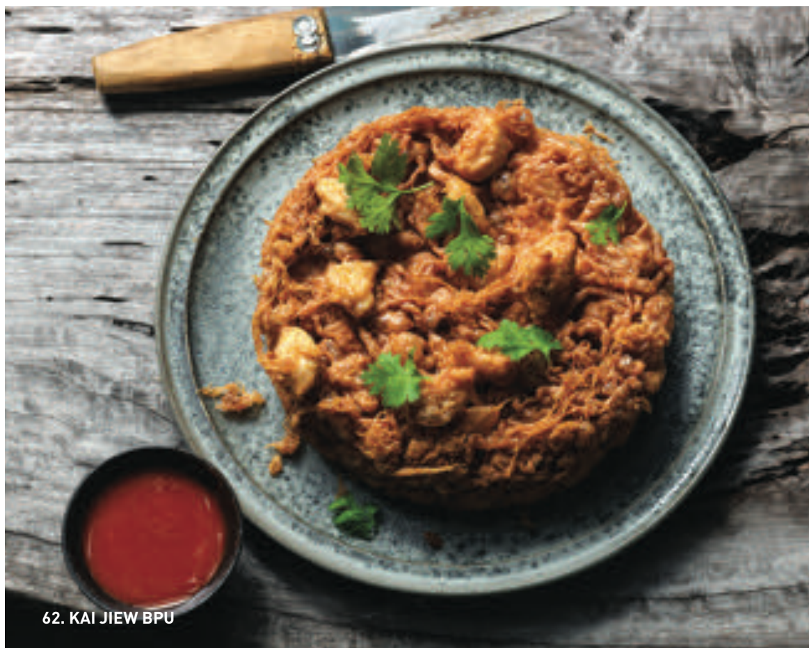
62. KAI JIEW BPU