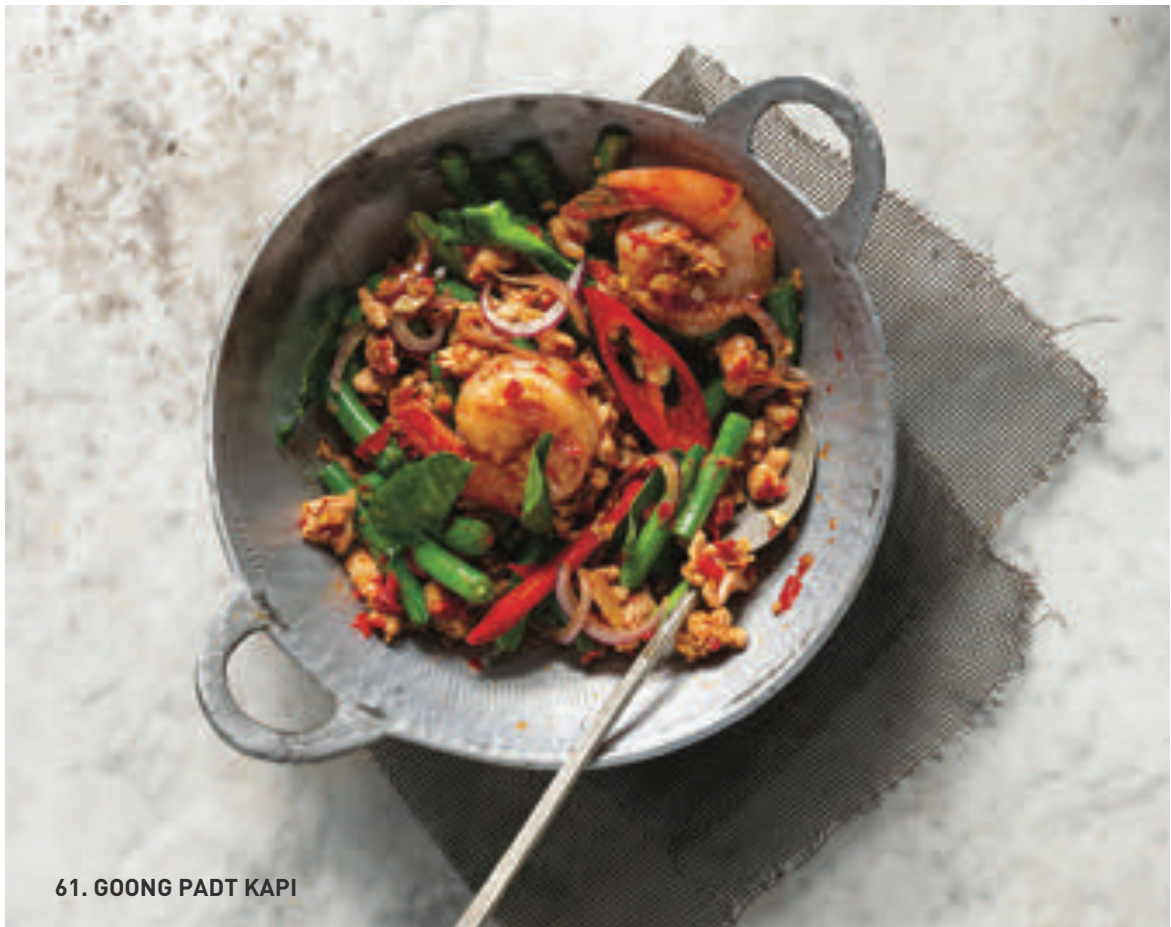
61. GOONG PADT KAPI