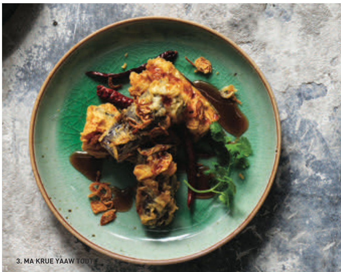
3. MA KRUE YAAW TODT

V : Some vegetarian versions, or mostly vegetable versions, are possible GF : Gluten Free Options available Please ask our friendly staff