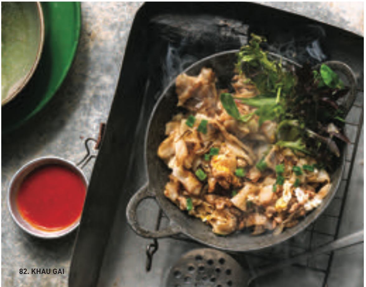
82. KHAU GAI