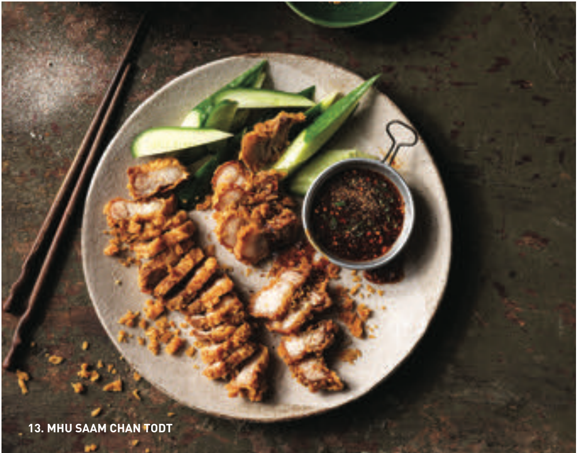
13. MHU SAAM CHAN TODT