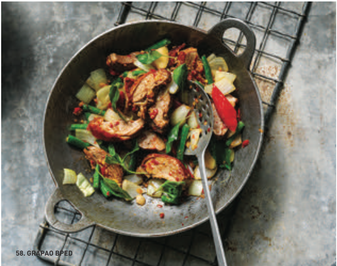
58. GRAPAO BPED