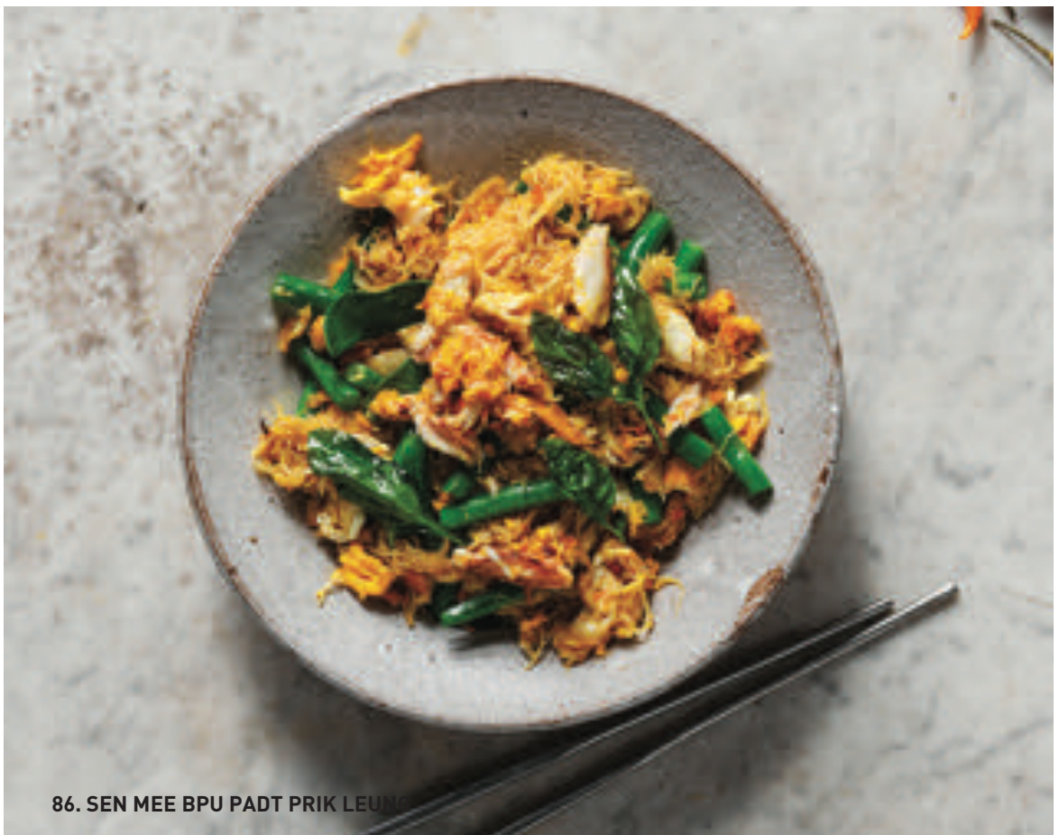
86. SEN MEE BPU PADT PRIK LEUM