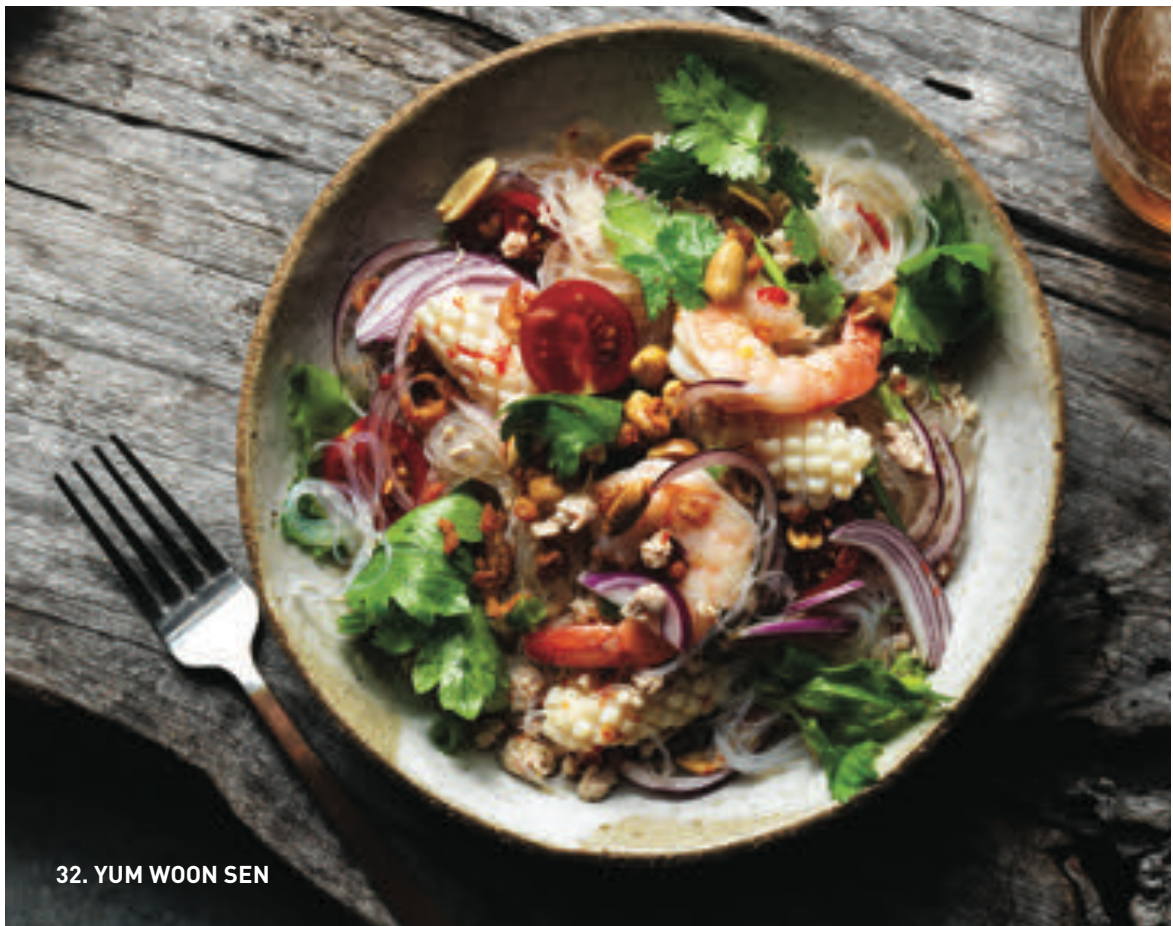
32. YUM WOON SEN