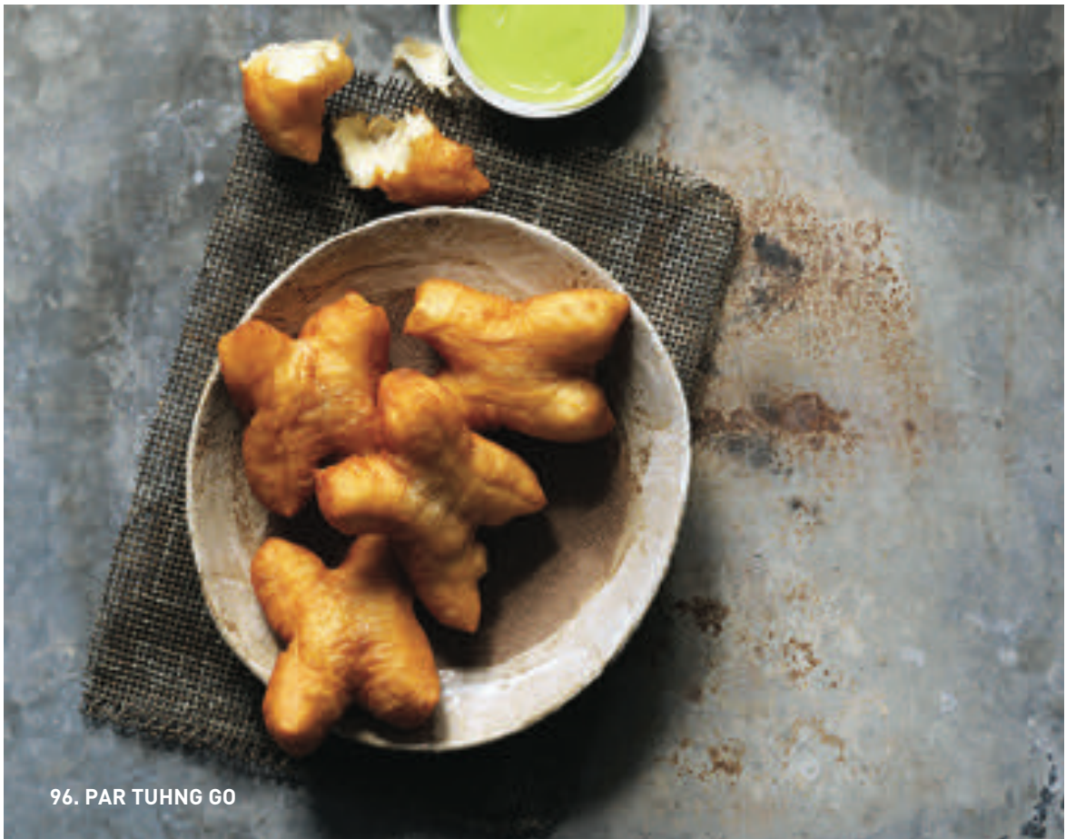
96. PAR TUHNG GO