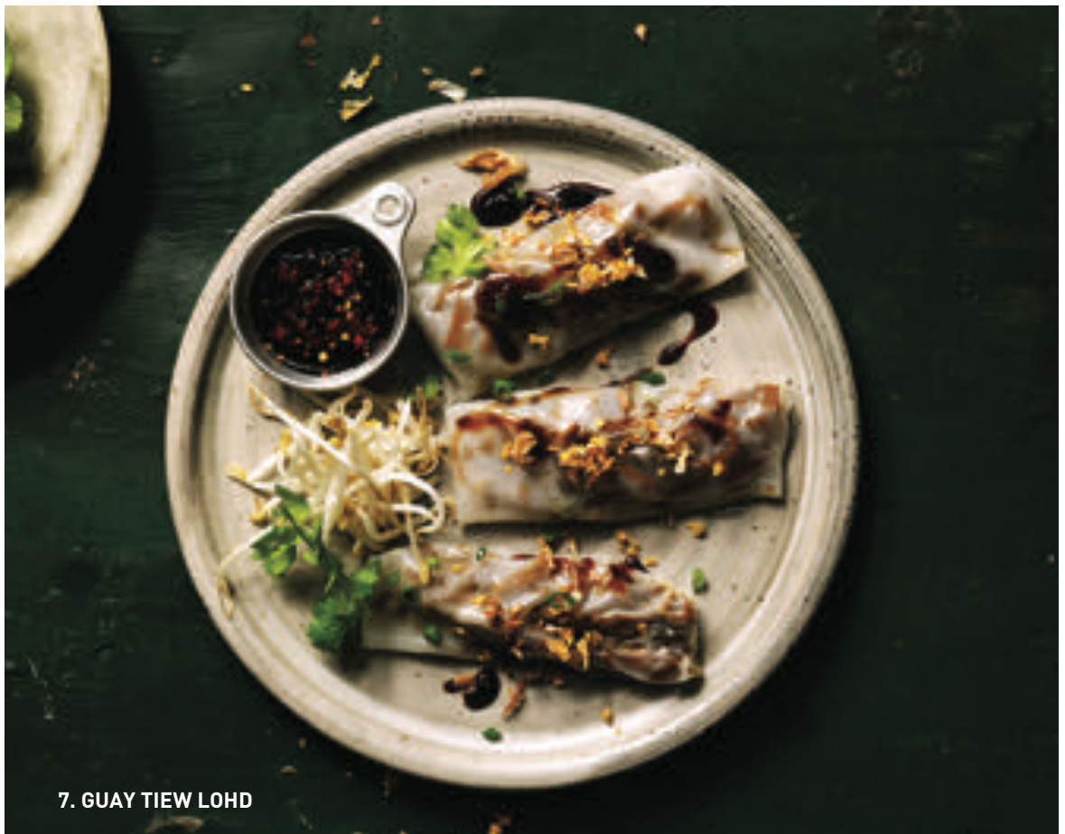
7. GUAY TIEW LOHD

V : Some vegetarian versions, or mostly vegetable versions, are possible GF : Gluten Free Options available Please ask our friendly staff