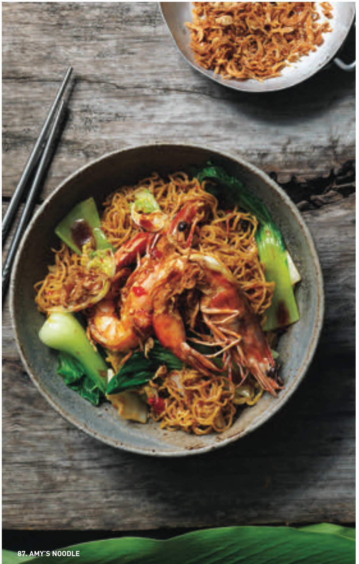
87. AMY'S NOODLE