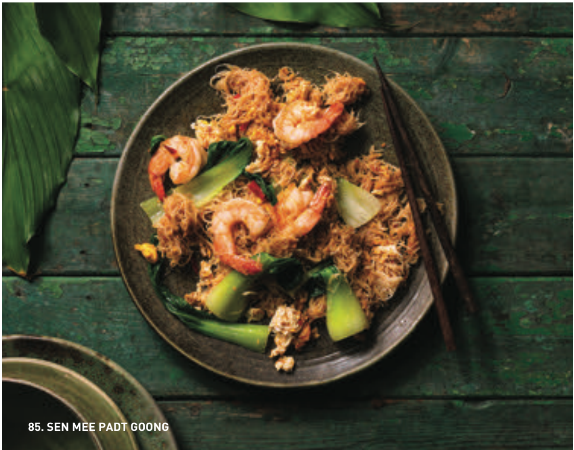
85. SEN MEE PADT GOONG