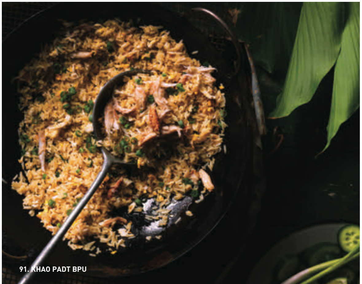
91. KHAO PADT BPU