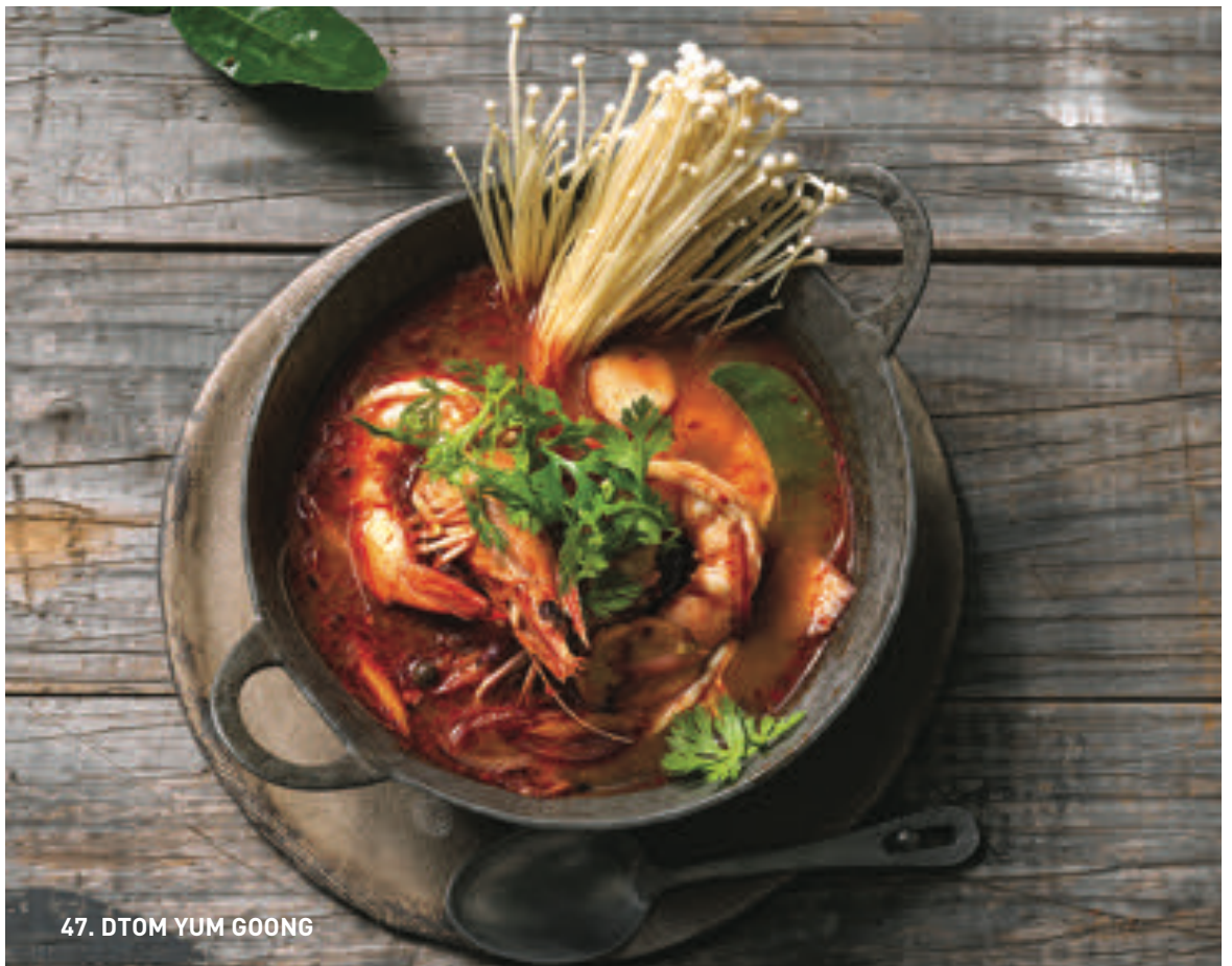
47. DTOM YUM GOONG