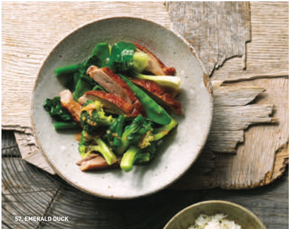
57. EMERALD DUCK