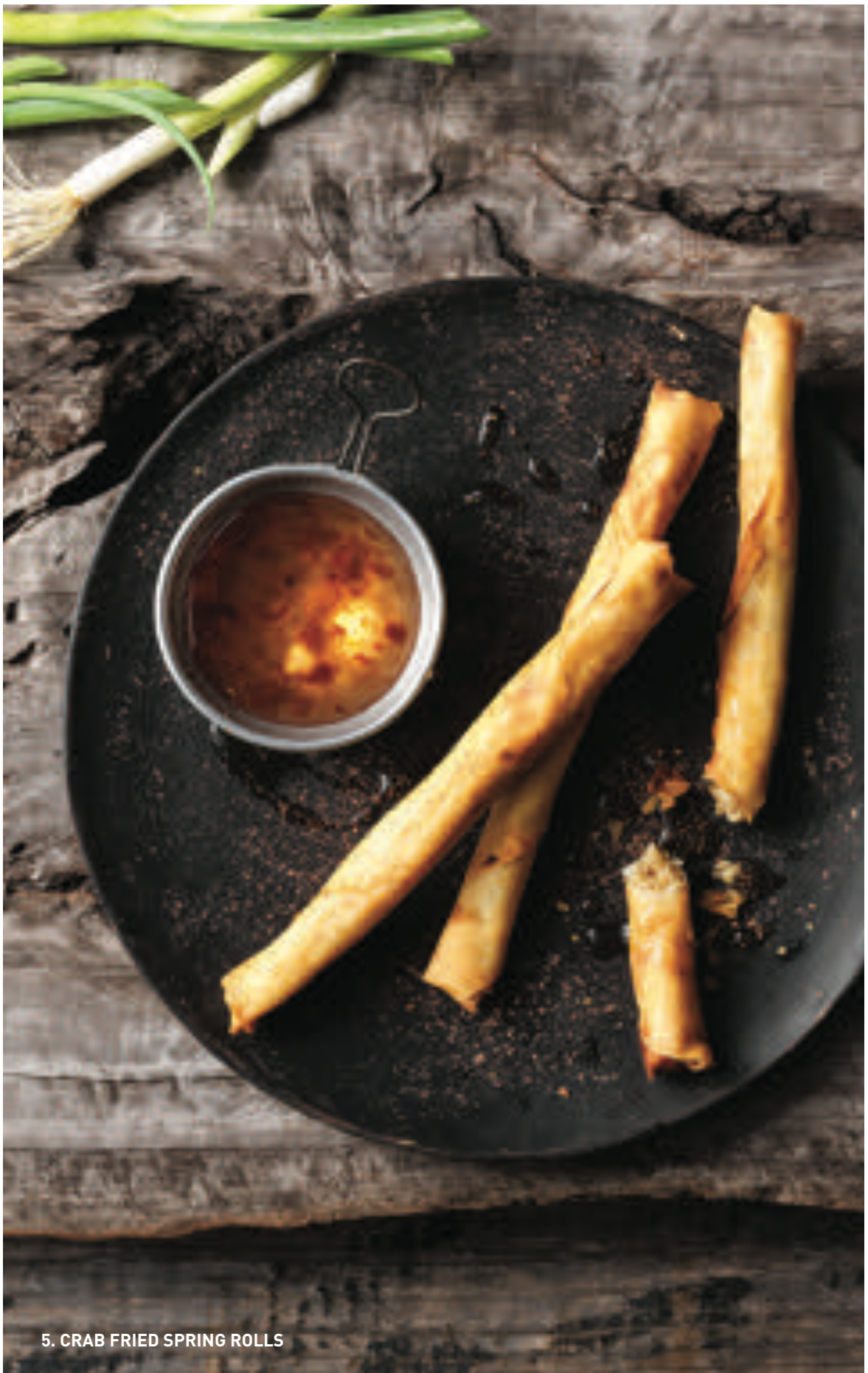
5. CRAB FRIED SPRING ROLLS