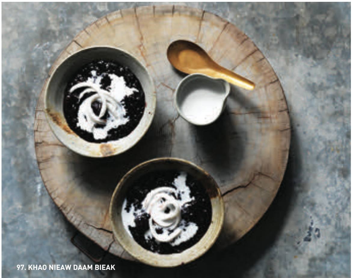
97. KHAO NIEAW DAAM BIEAK