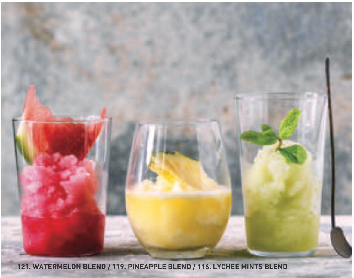
121. WATERMELON BLEND / 119. PINEAPPLE BLEND / 116. LYCHEE MINTS BLEND