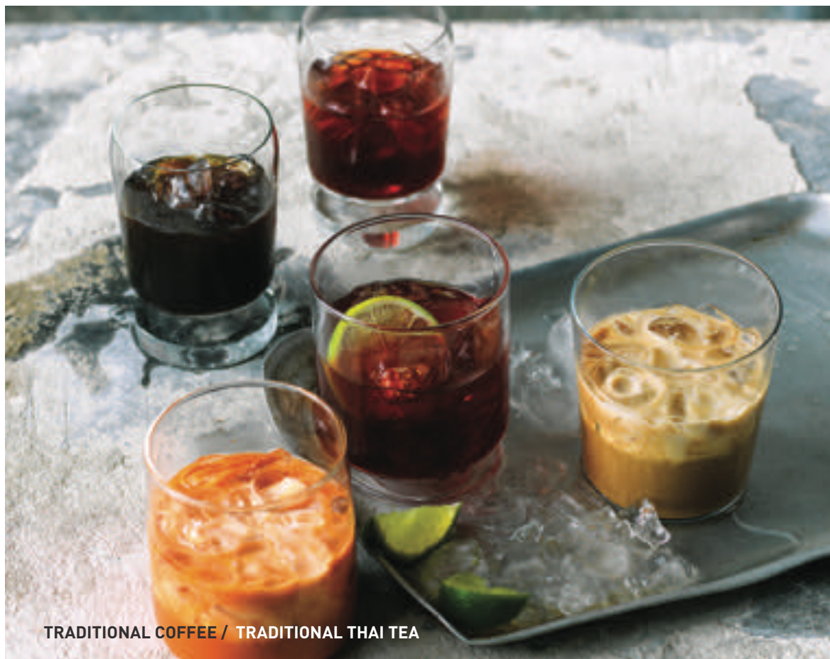
TRADITIONAL COFFEE / TRADITIONAL THAI TEA