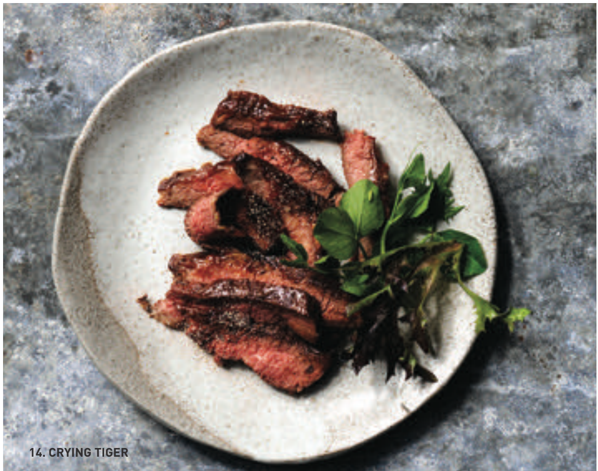
14. CRYING TIGER