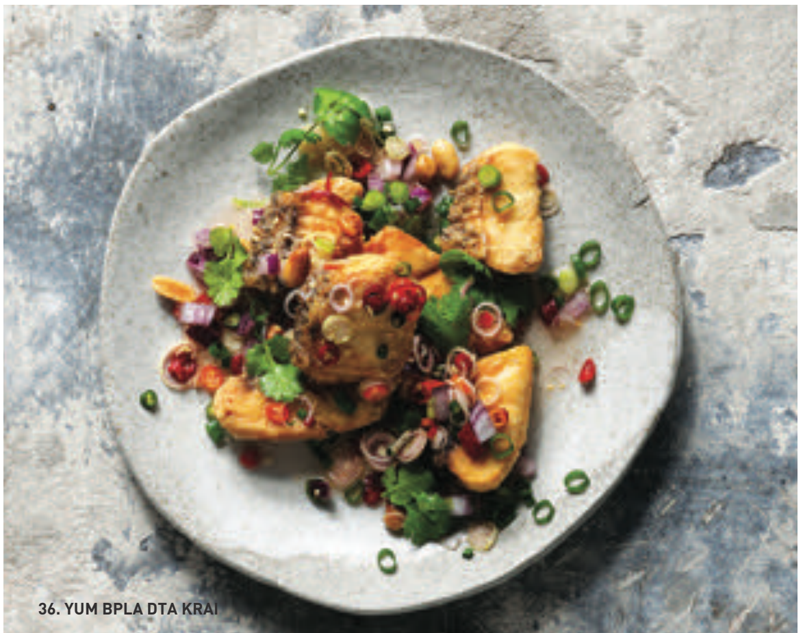
36. YUM BPLA DTA KRAI