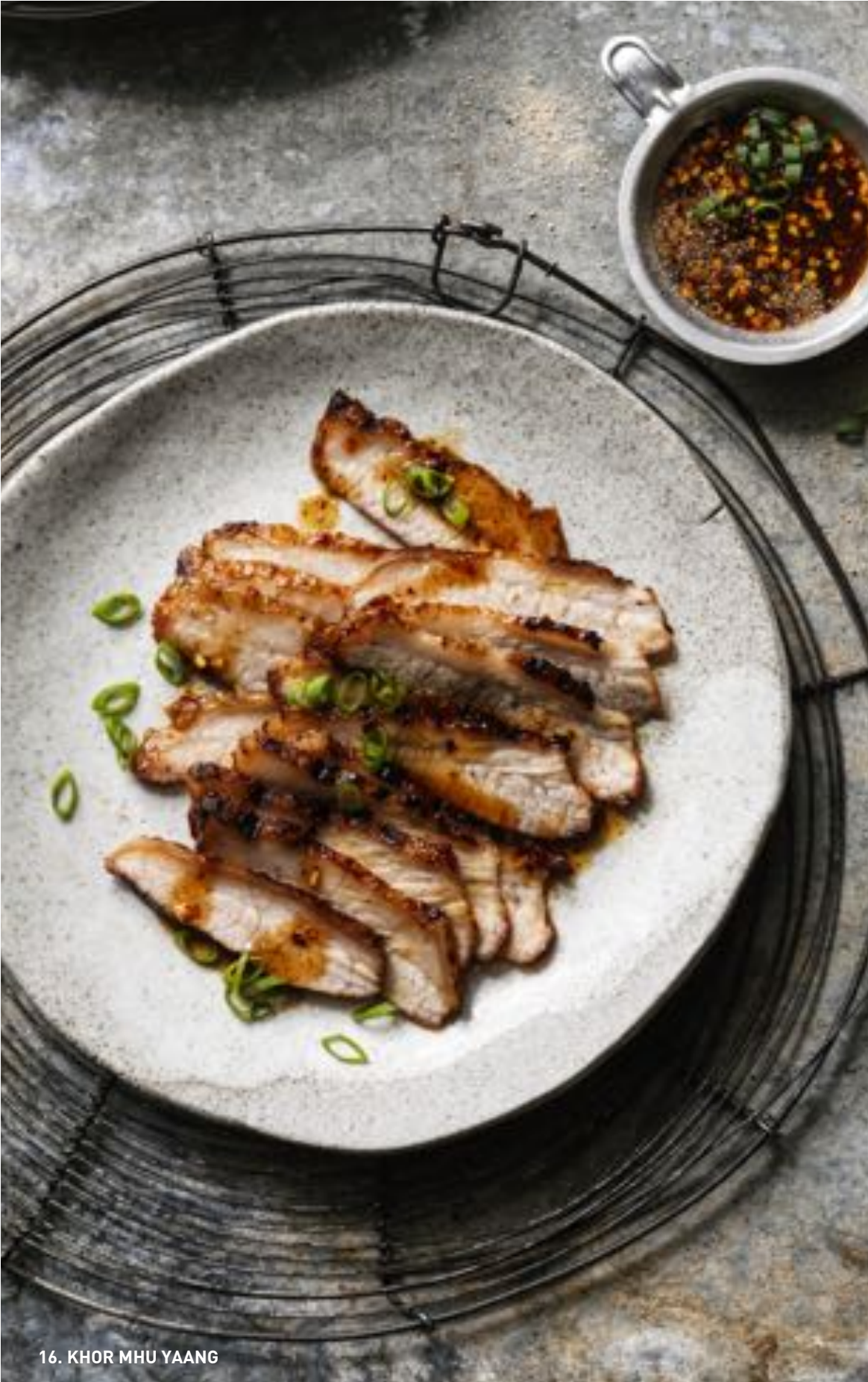
16. KHOR MHU YAANG