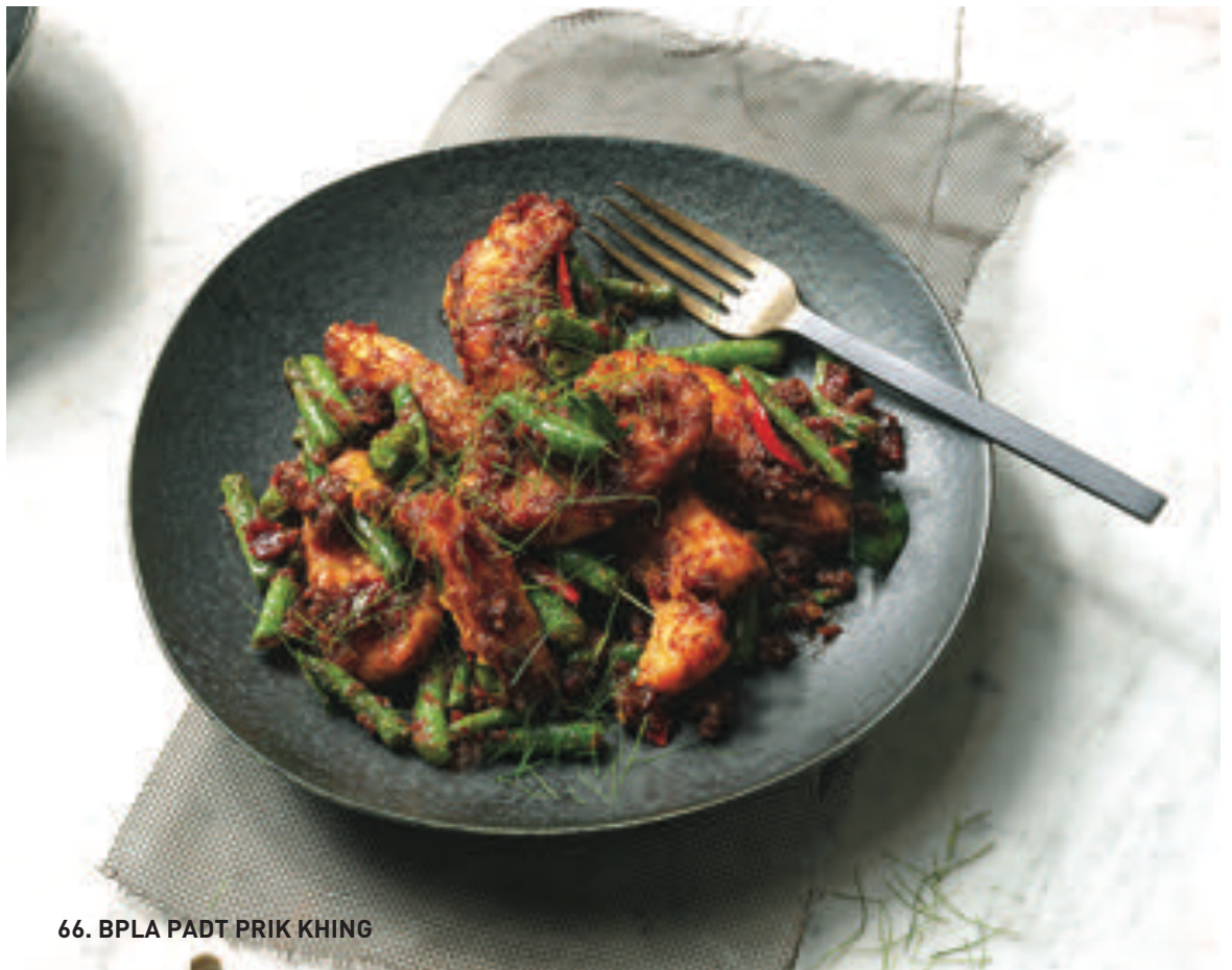
66. BPLA PADT PRIK KHING