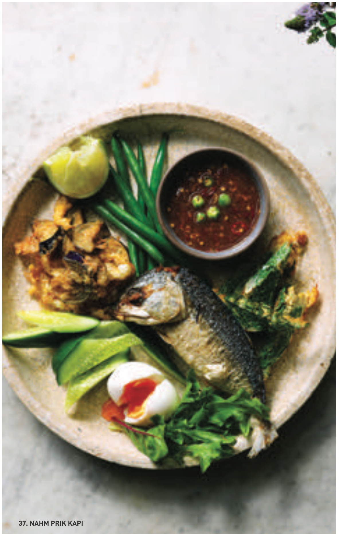
37. NAHM PRIK KAPI