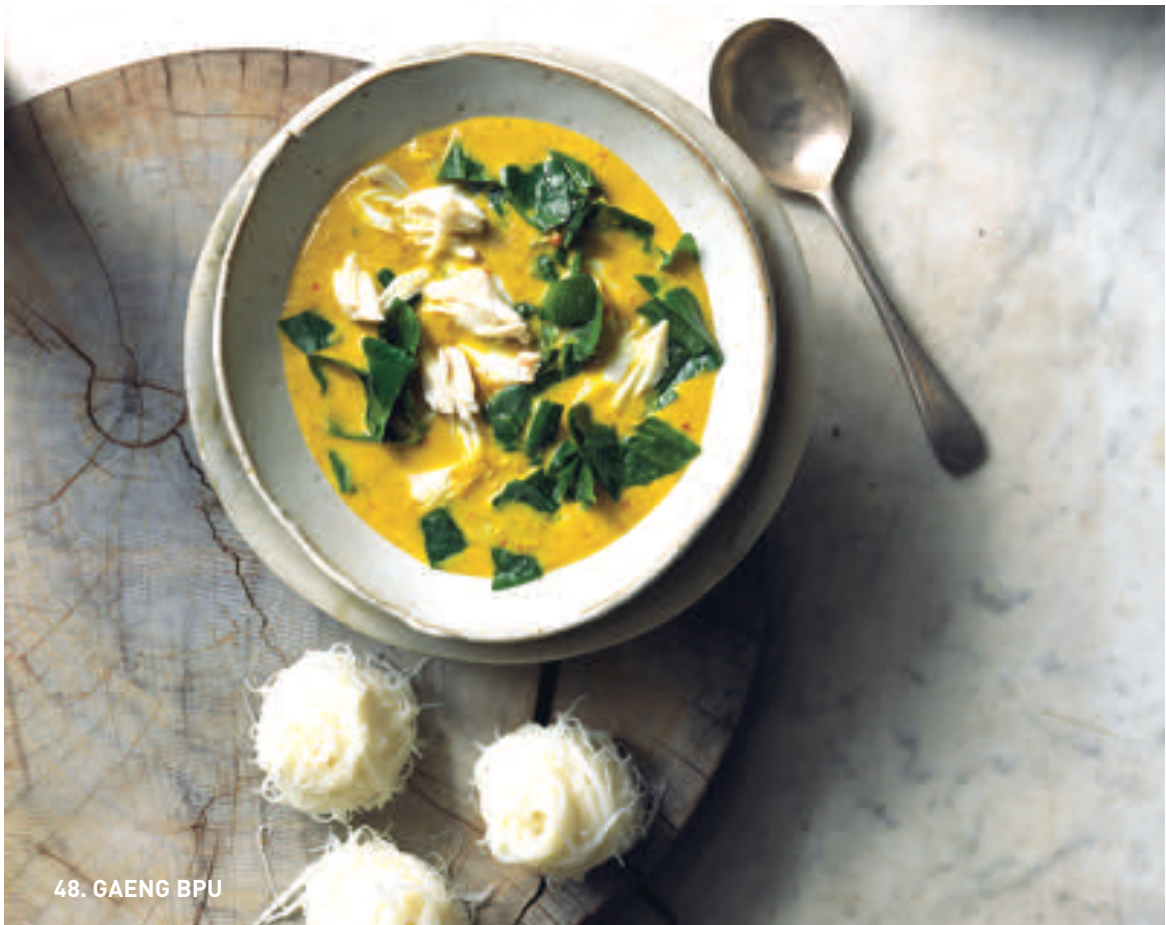
48. GAENG BPU

V : Some vegetarian versions, or mostly vegetable versions, are possible GF : Gluten Free Options available Please ask our friendly staff