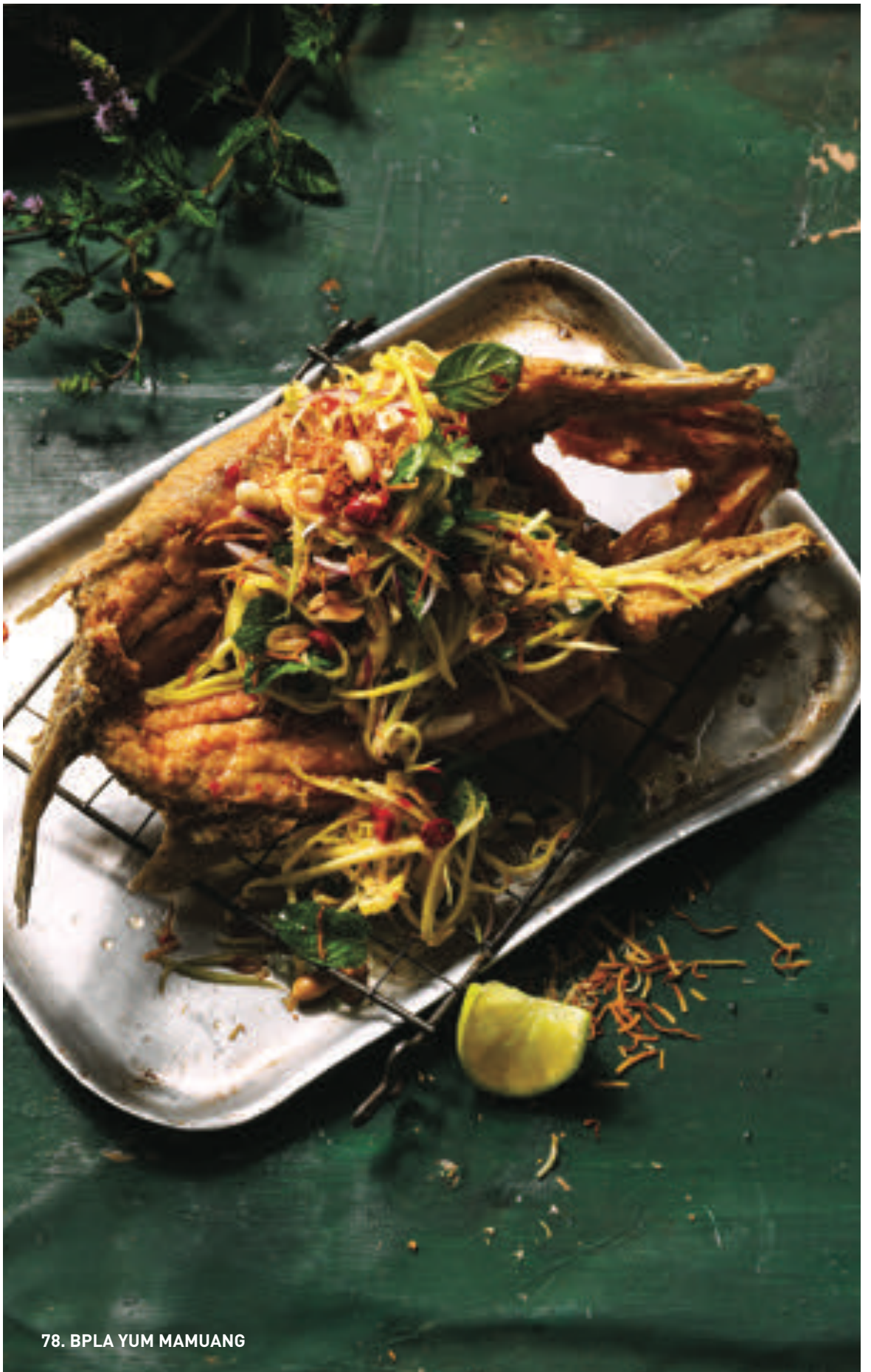
78. BPLA YUM MAMUANG